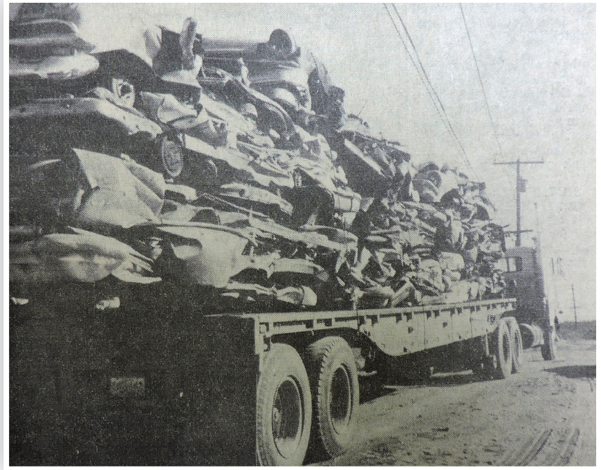
A truckload of flattened cars leaves Hermiston in 1970.

Extensive preparations have been completed by the United Drug Company of Boston and St. Louis to make the wonder-drug Penicillin instantly available to its distributors, the Rexall Drug Stores throughout the country on March 15 when the War Production Board authorized the general release