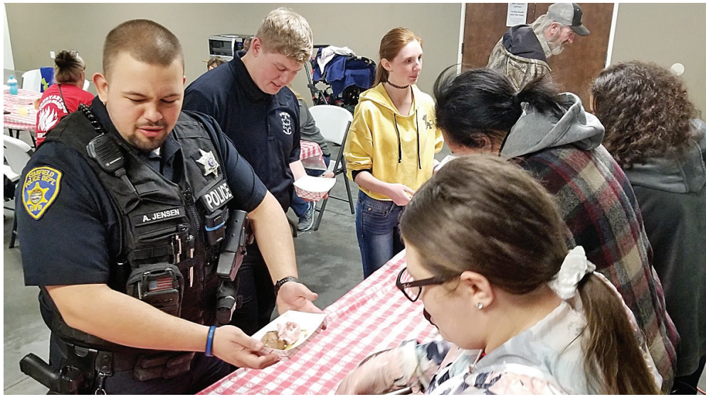
Food was plentiful during Cabin Fever for Kids, held Feb. 15 at the Hermiston Christian Center & School. Nearly 200 area foster kids, their families and community partners enjoyed food, games and indoor fun.