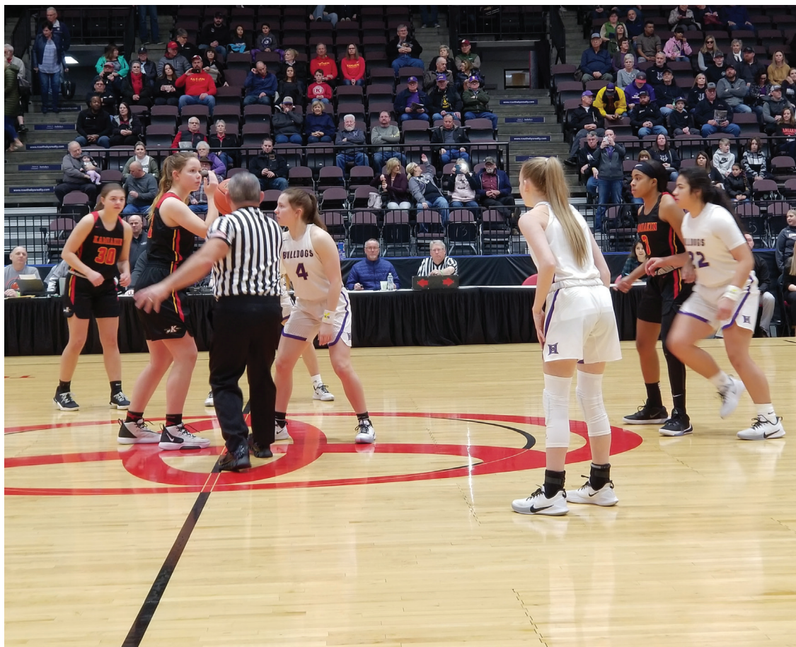
Hermiston and Kamiakin met in a District 8 loser-out game on Friday morning at Toyota Center in Kennewick, Wash. The Braves beat the Bulldogs 60-50.

Kamiakin opened the second quarter on a 7-0 run to pull with