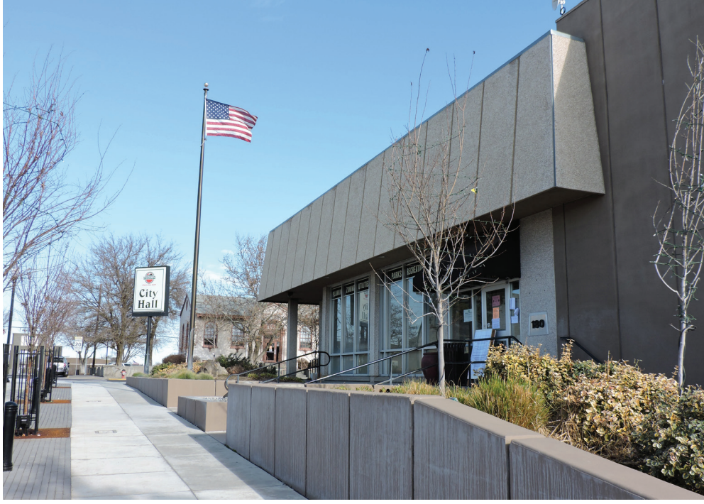
The Hermiston City Council is considering tearing down the current city hall and building a $9 million replacement on the site.