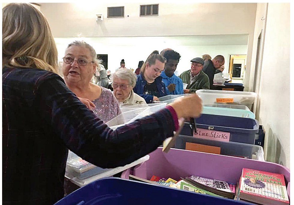
Members of Stanfield Baptist Church use an assembly line method to fill boxes this past fall for Operation Christmas Child.

For more information, search Facebook for American Legion Post 37 or VFW Desert Post 4750. For questions or to make a donation, contact Stolz at 541-571-5816 or cathystolz@gmail.com.