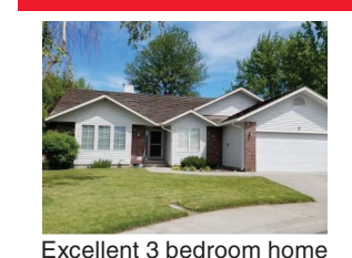
Excellent 3 bedroom home located at 3 SE Crestline PL. Hermiston Asking $305,000

$330,000 2 STORY BUNGALOW w/5,000sf(m/l). Hardwood floors, amazing kitchen, quartz countertops, stainless steel appliances. Finished attic converted to master suite, basement w/ guest bedroom, fullbath. Jason 760-409-6842 cell. #19346733