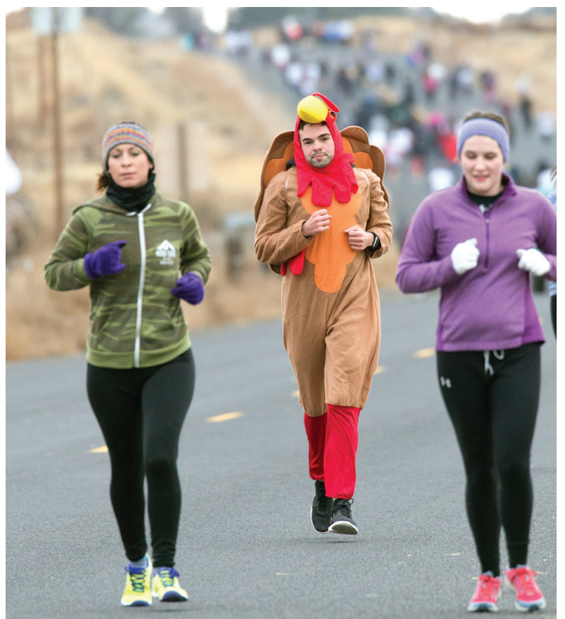
Above, a tutu-clad runner and her dog participate in Thursday's Turkey Trot in Echo. At right, participants included a runner dressed as a turkey