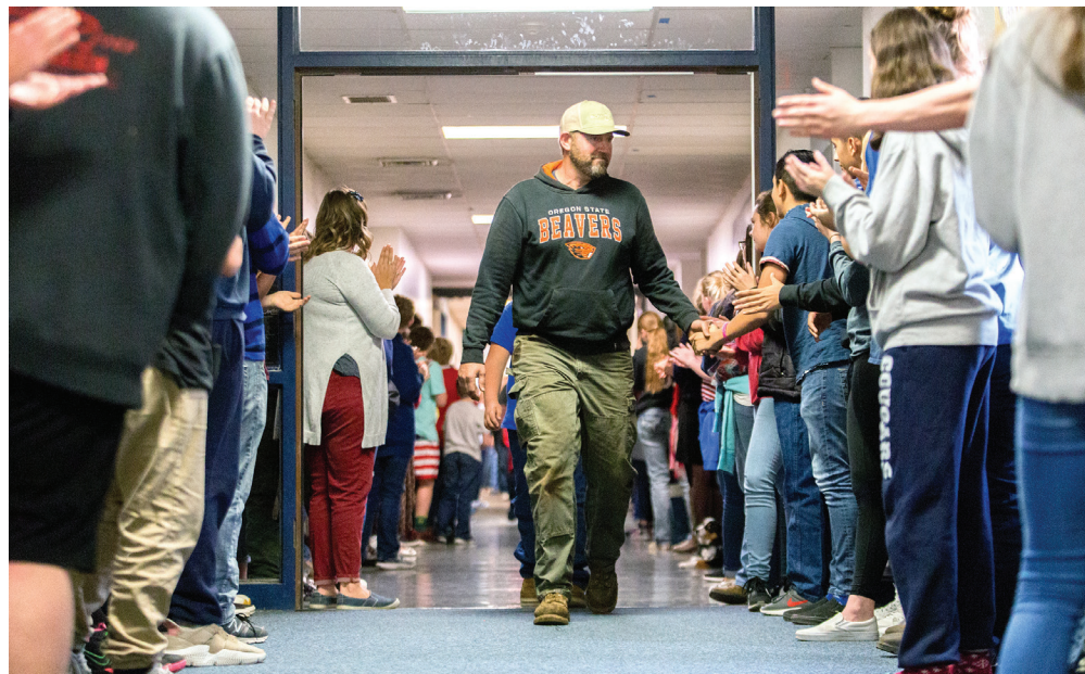
Echo students line a school hallway Thursday during a tradition they call the Tunnel of Honor to honor local veterans.