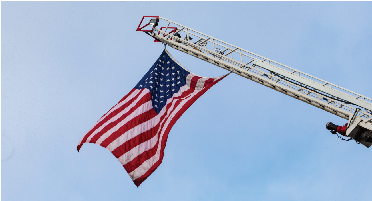
An American flag hangs from a Umatilla County Fire District ladder truck at a Veterans Day breakfast hosted by the Hermiston Chamber of Commerce at the Hermiston Community Center Monday morning.