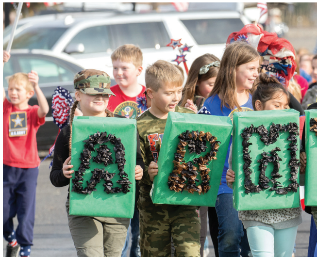
Echo students took to the streets during a veterans celebration parade on Thursday, marching down Main Street and back to the school for a special assembly honoring local veterans. Each elementary school grade adopted a different branch of the service.