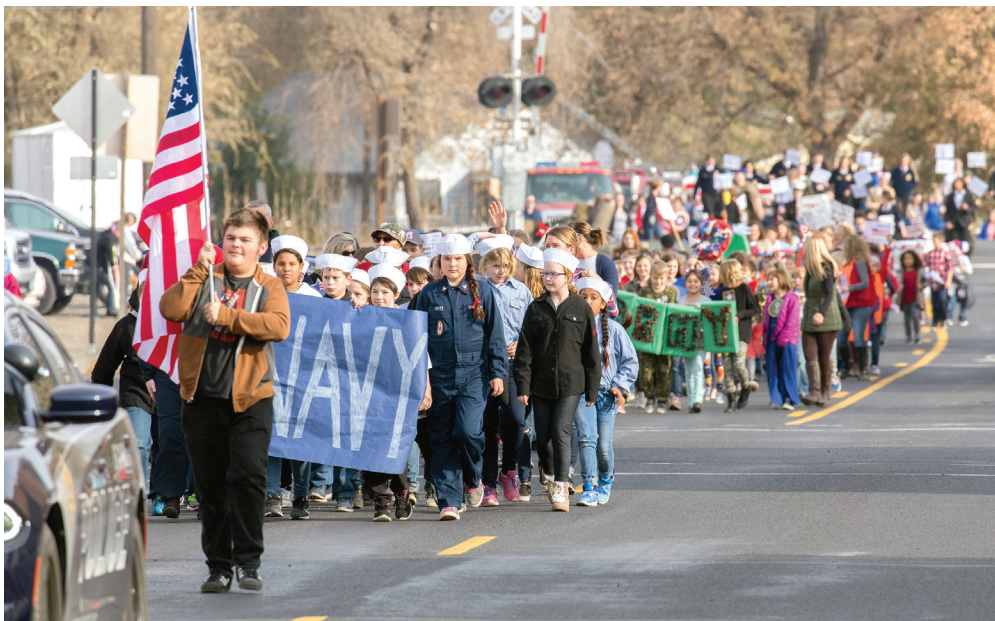
Echo students took to the streets during a veterans celebration parade on Thursday, marching down Main Street and back to the school for a special assembly honoring local veterans.