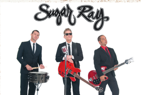
Sugar Ray Saturday, Aug. 10th