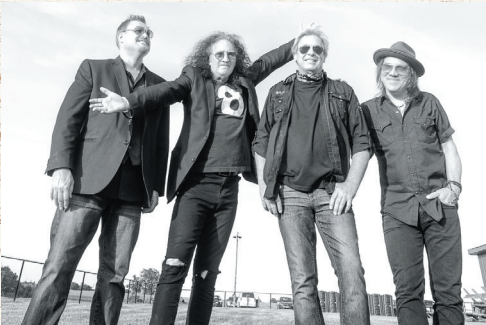
The Georgia Satellites Thursday, Aug. 8th