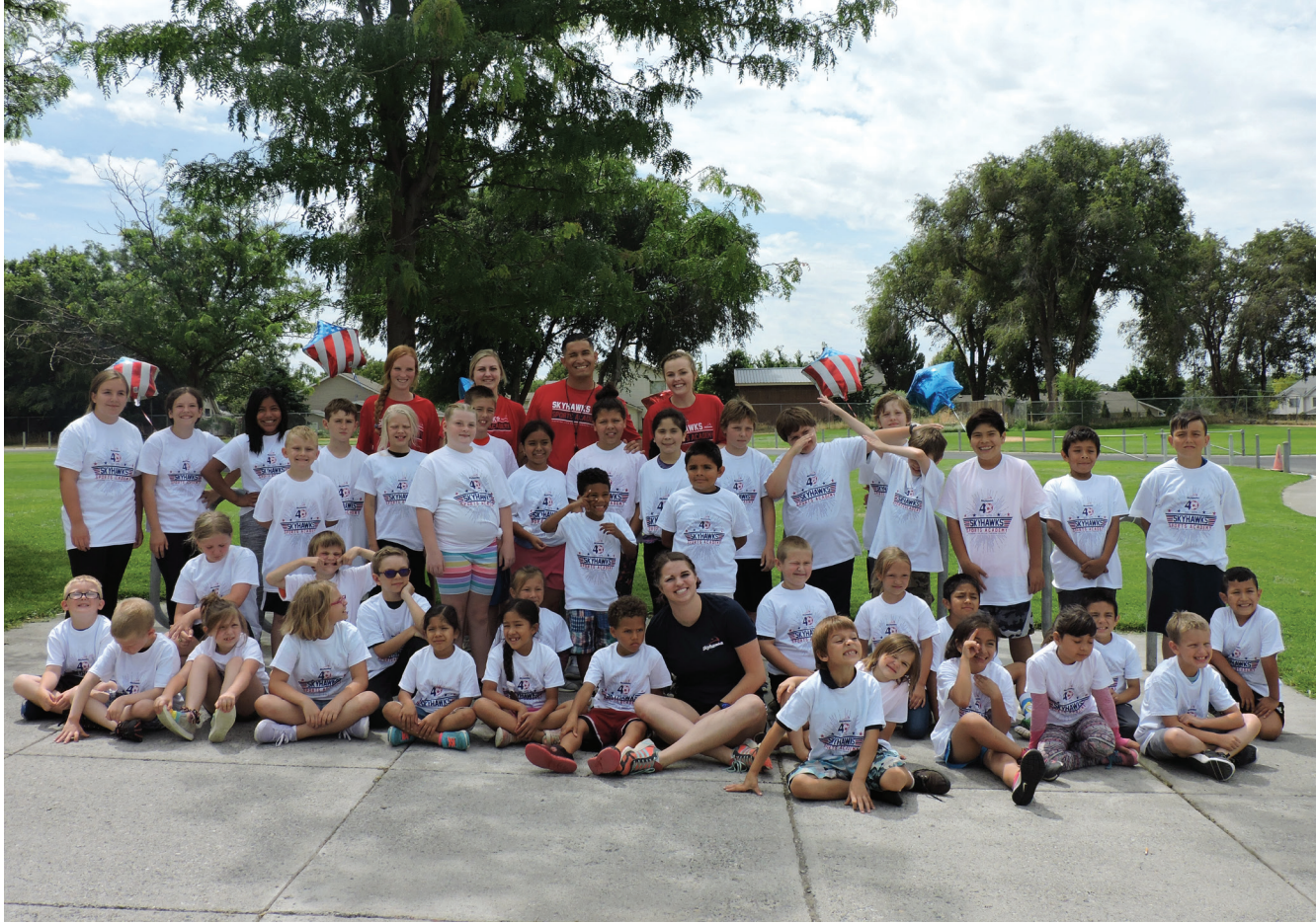
Campers settle down outside Sandstone Middle School.

“We’d like to be able to do this on an annual basis