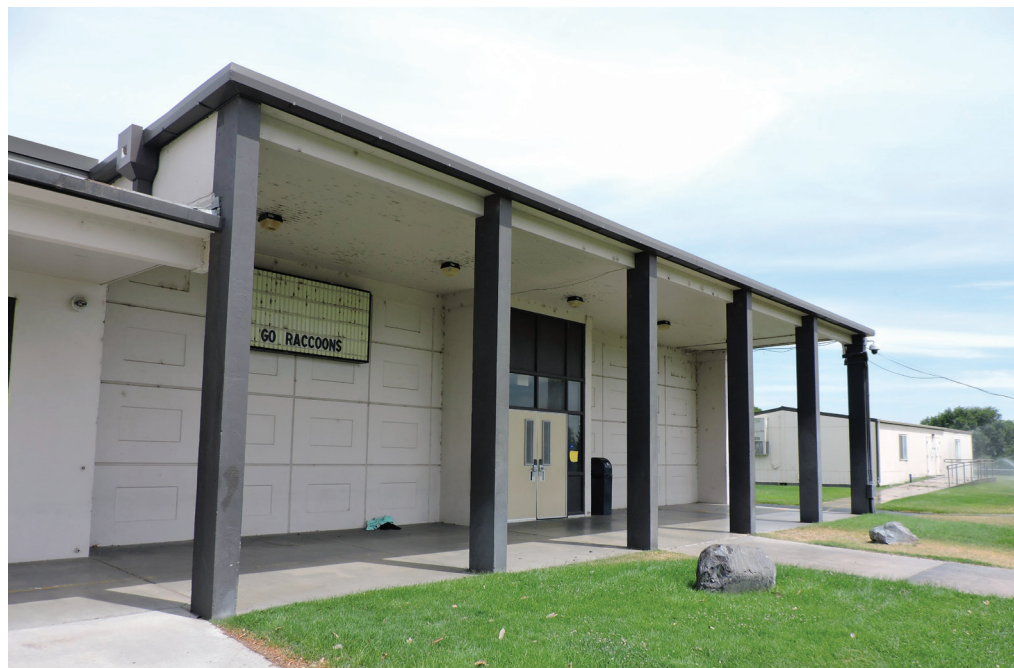
Rocky Heights Elementary School would be replaced with a new, larger school on the same property if a school bond is approved by voters in November.