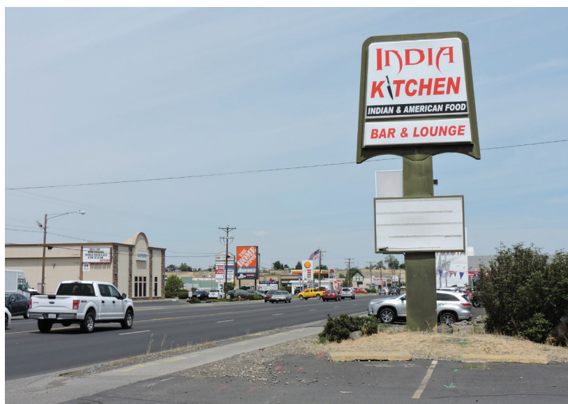
Panda Express is tearing down the former India Kitchen building in Hermiston's commercial corridor to build a new restaurant.