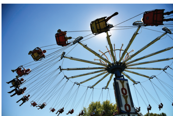
Patrons ride the Yoyo at the Umatilla County Fair in 2016 in Hermiston.