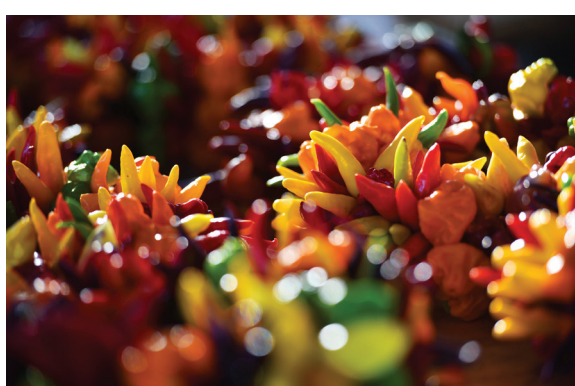
Pepper wreaths from Bautista Farms sit in the sunlight in 2018 at the Hermiston Farmers Market.