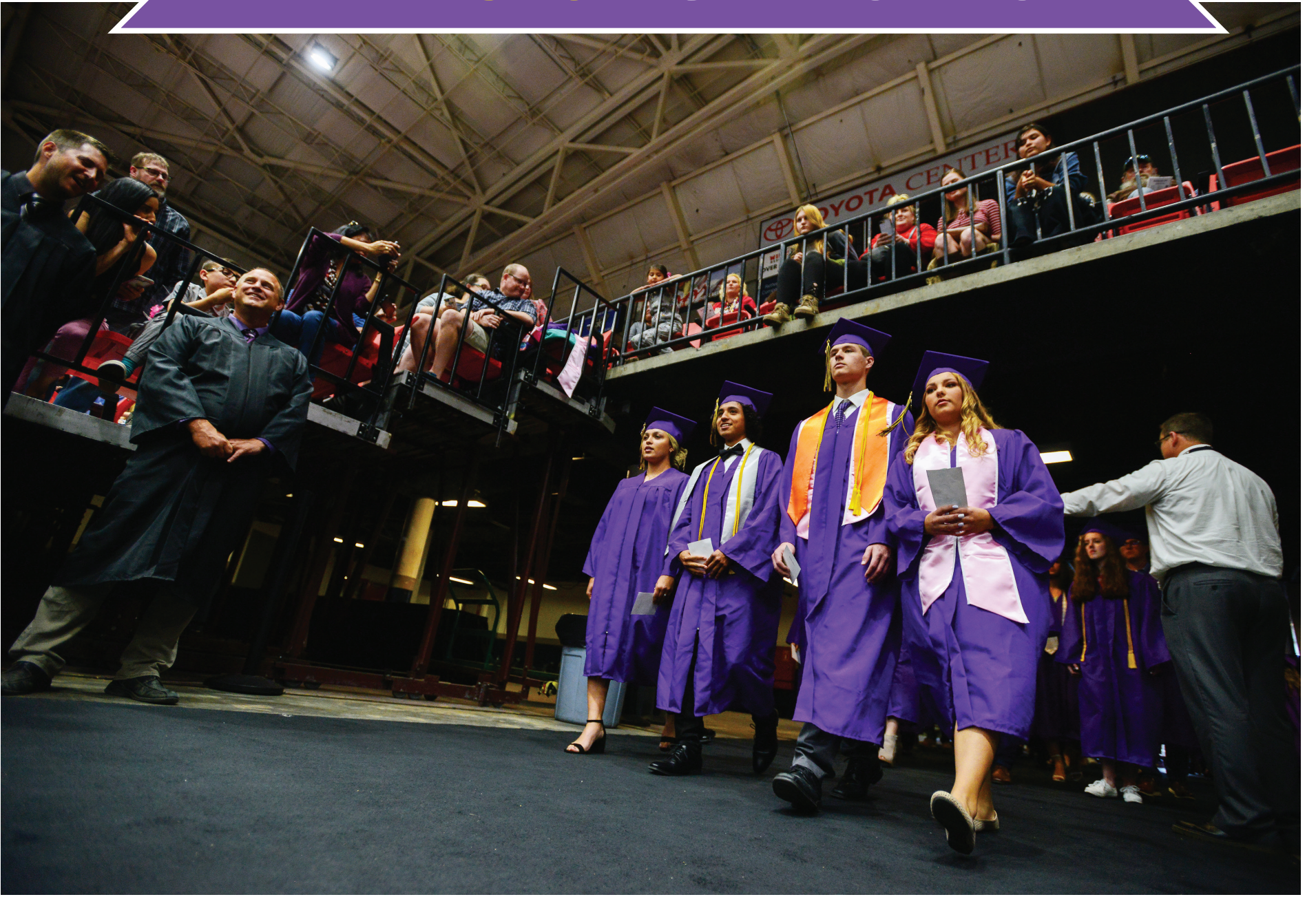
Hermiston graduates walk out onto the floor of the Toyota Center during their commencement ceremony on Thursday in Kennewick.