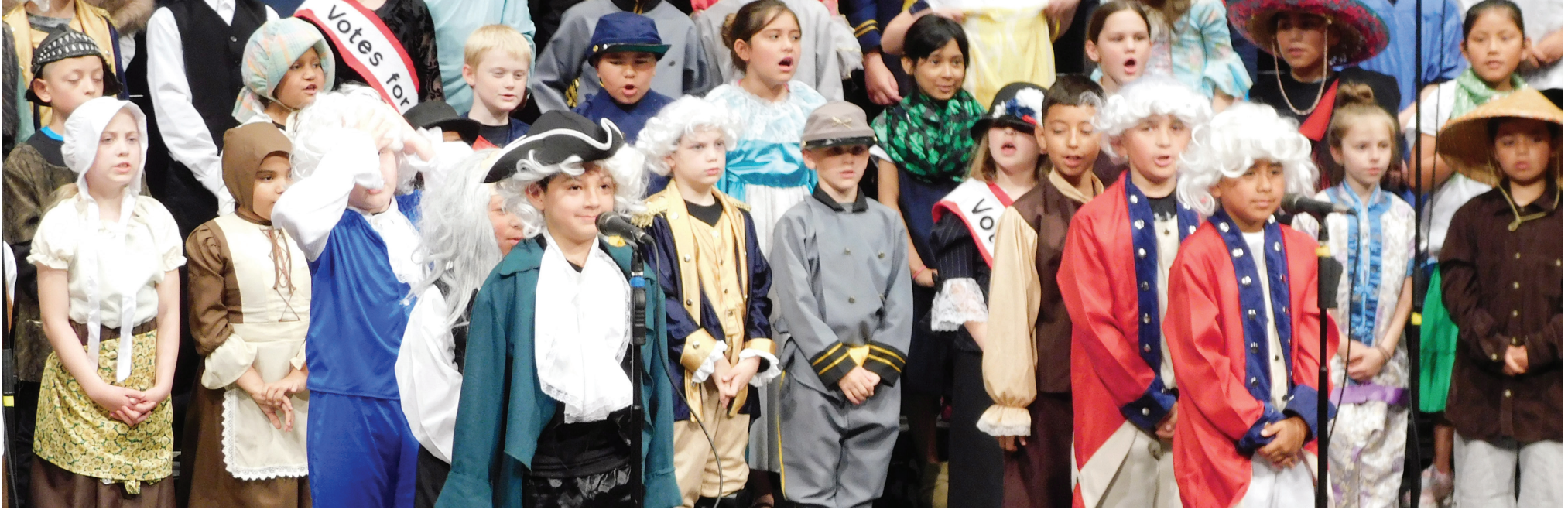
Students playing British and American soldiers talk about the Revolutionary War during "The American Dream," a play by Rocky Heights Elementary School third graders about the history of the United States.