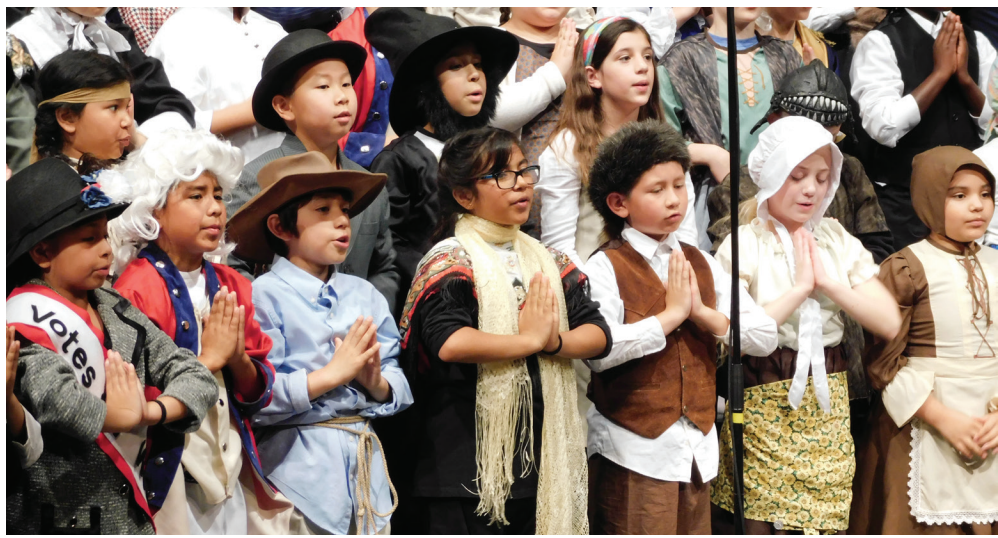
Rocky Heights Elementary School third graders dressed as figures from American history sing a group number during their Friday morning performance of "The American Dream," a musical play charting the history of the United States.