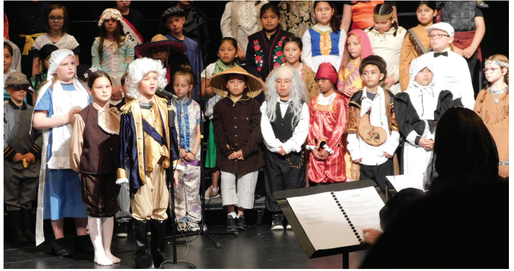
A Colonist shares about the founding of the United States during "The American Dream," a play performed Friday by Rocky Heights Elementary School third graders.