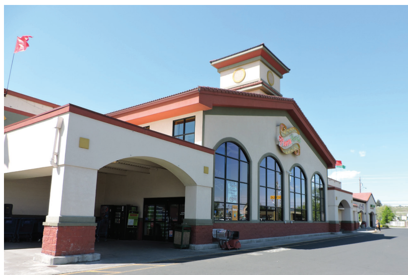
Fiesta Foods is going out of business in Hermiston.

She said Grocery Outlet is planning to open in the building, located at 1875 N. First St. Grocery Outlet confirmed that they are coming to Hermiston sometime in 2020 but did not have further information for now.