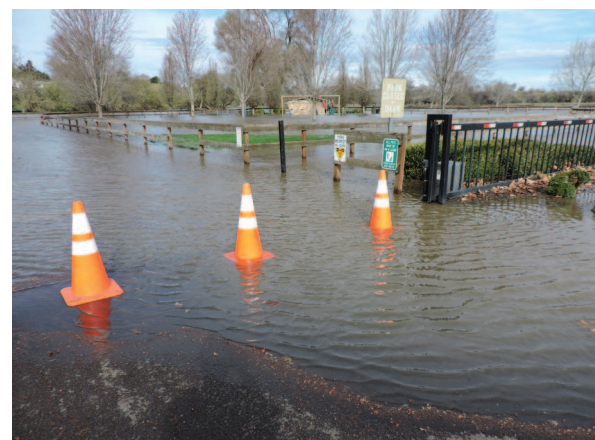
The playground at Riverfront Park was flooded Tuesday as rains pushed the Umatilla River over its banks.