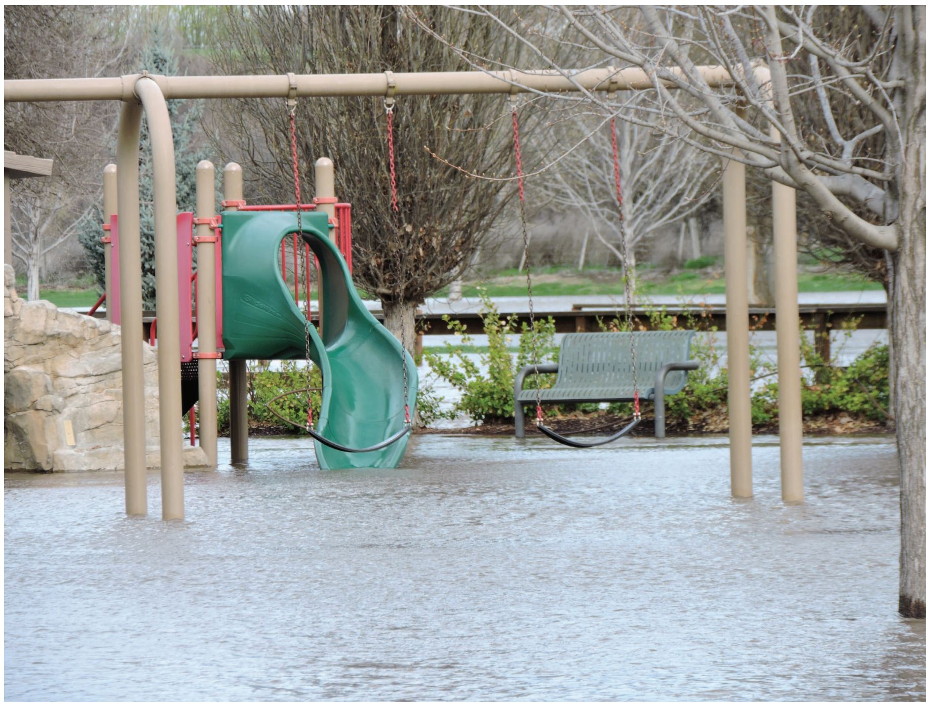
Floodwater covers the playground at Riverfront Park Tuesday morning.