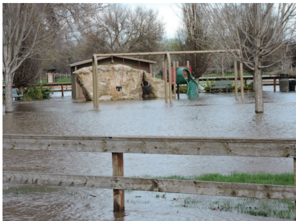
The Umatilla River charted a new course along the Oxbow Trail after it flooded Tuesday.