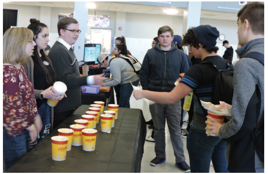
Employees from the movie theater help students fill out applications for summer jobs during Futures Week at Hermiston High School.