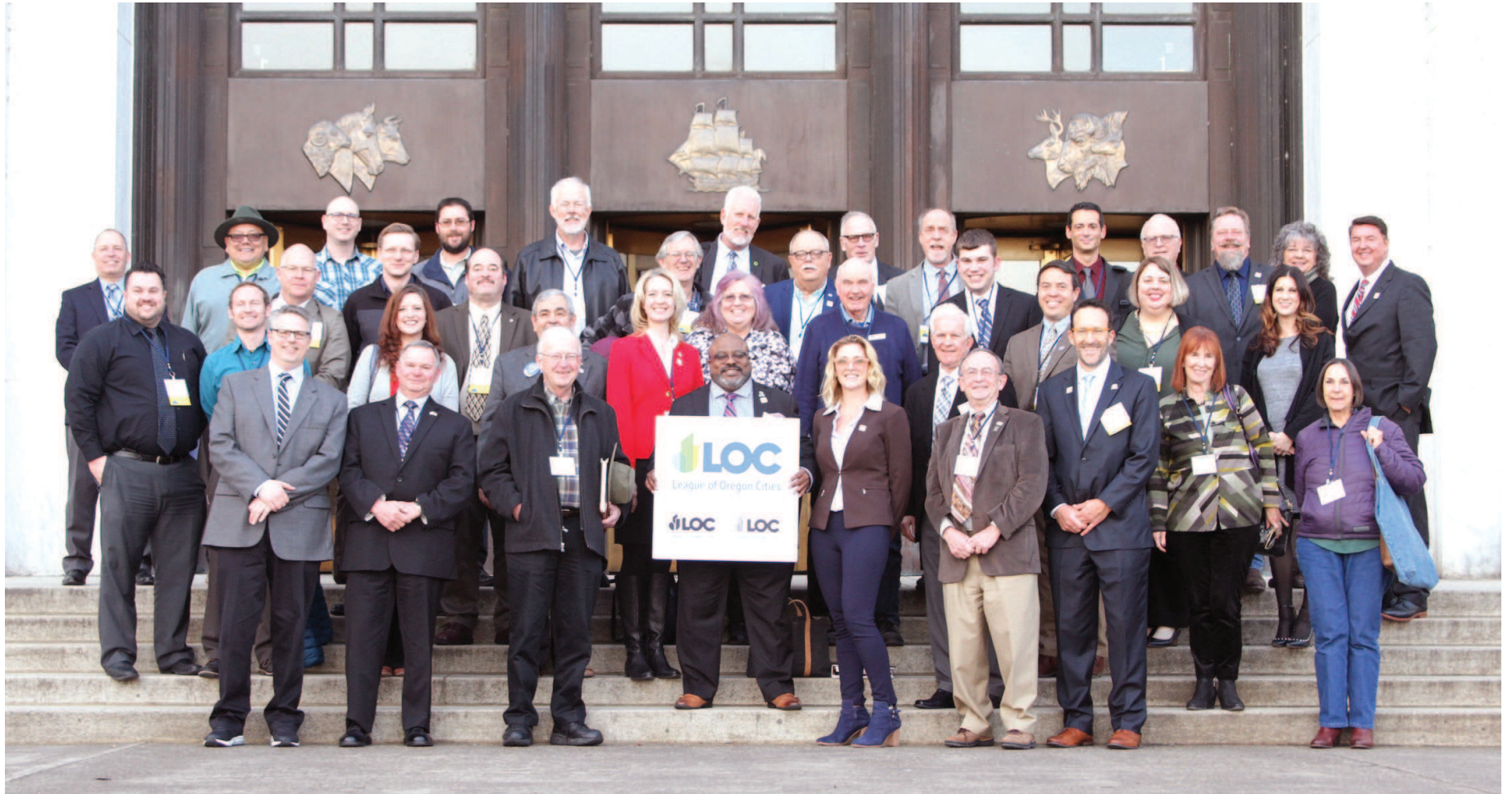
Representatives of cities around the state of Oregon visited the capitol building in Salem on Jan. 24 to meet with state lawmakers and advocate for priorities for their own cities and the League of Oregon Cities.