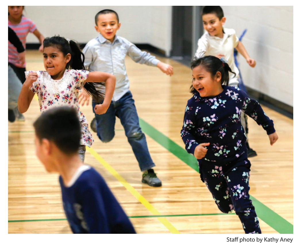
McNary Heights second-graders run around their new gym Wednesday to warm up for class.