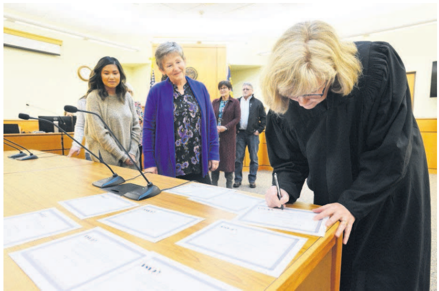
Umatilla County Circuit Court Judge Eva Temple signs a certificate of completion for a new CASA volunteer after a swearing in ceremony Monday in Hermiston.