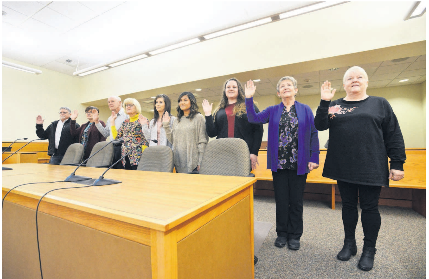
New CASA volunteers holds their right hands in the air while being sworn in Monday in the courtroom of Umatilla County Circuit Court Judge Eva Temple in Hermiston.