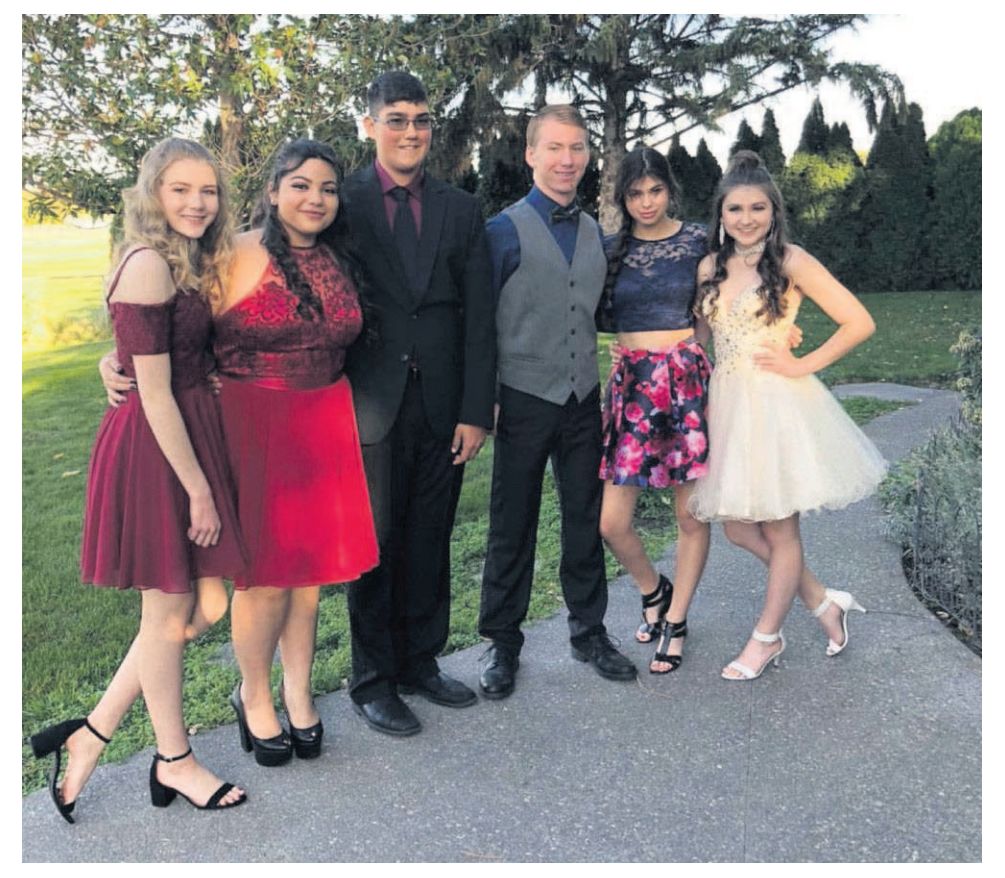
Hermiston High School students get ready to head to the this weekend's Homecoming dance.

Hermiston High School celebrated Homecoming last week with pep rallies, dress-up days, a carnival, mud battles, a football game, dance and more. For more coverage of Homecoming, see A3 and the sports section.