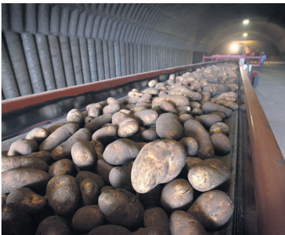
Potatoes ride a conveyor belt into a cold storage facility outside of Hermiston in 2014.

"The higher heat during the summertime has been a bit of an issue, only on select varieties," Brewer said. "So