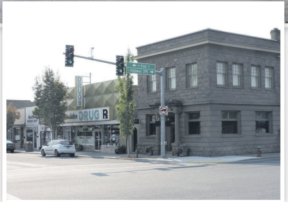
ABOVE: Hermiston's Main Street in the early 1900s. BELOW: Hermiston's Main Street today.

There are pieces of Hermiston's history that have been preserved, in boxes of photographs at locals' homes and a few scattered