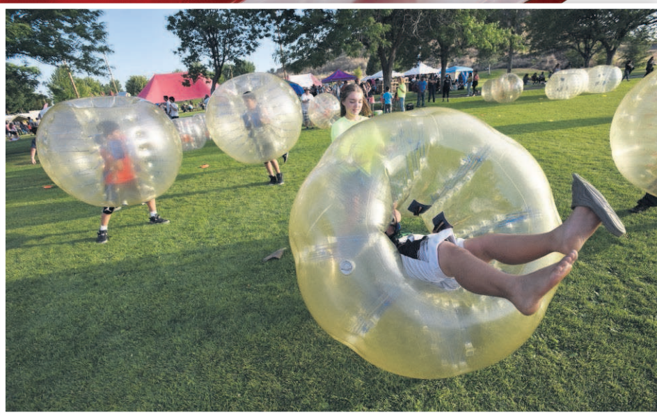
Children play in bubble balls on the soccer fields at Butte Park during the Fourth of July celebration in Hermiston.