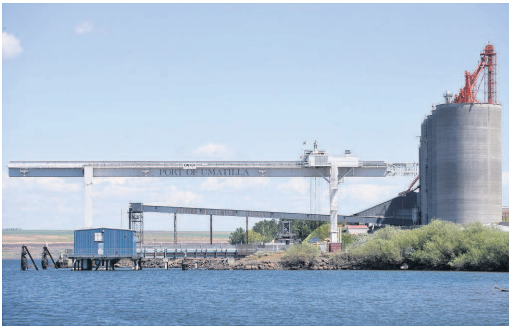
In 2004, the Port of Umatilla installed a new $3.8 crane at the facility on the Columbia River outside of Umatilla.

Puzey said while the way data centers are counted can be variable, he counts five on port property, and said more could be developed.