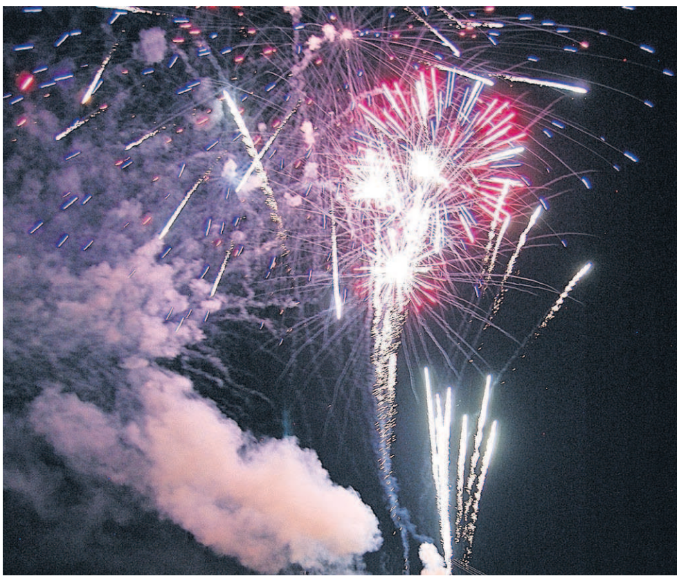
An explosion of color fills the night sky above the Hermiston Butte during the 2017 Fourth of July fireworks display. Several area communities will offer activities and fireworks shows to celebrate Wednesday's Independence Day.