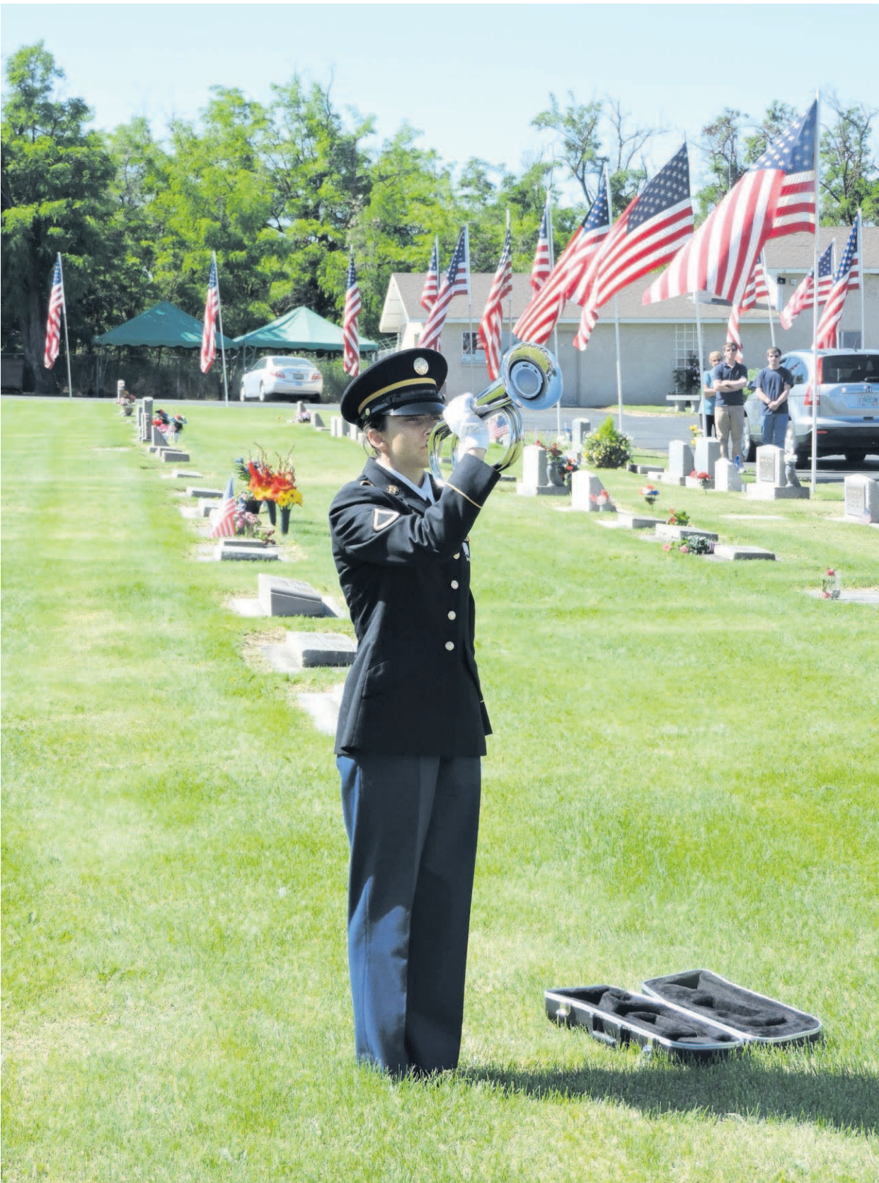
A member of the U.S. Army Honor Guard plays "Taps" at the end of the Memorial Day ceremony in Hermiston.