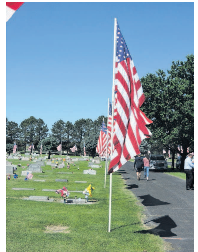
Flags erected for Memorial Day line the roads of the Hermiston Cemetery.