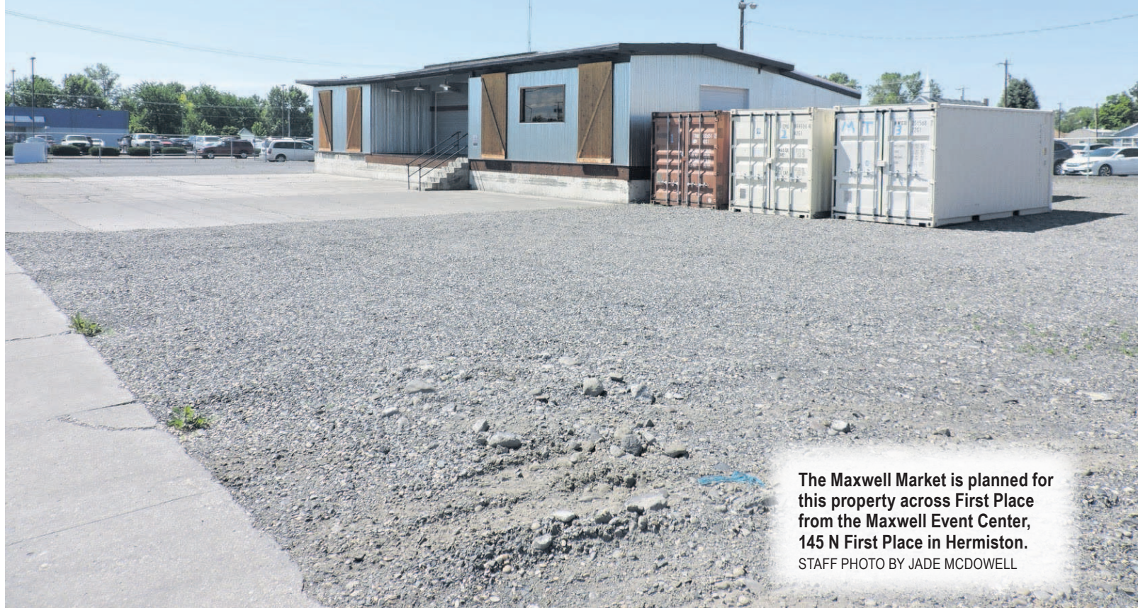
The Maxwell Market is planned for this property across First Place from the Maxwell Event Center, 145 N First Place in Hermiston.