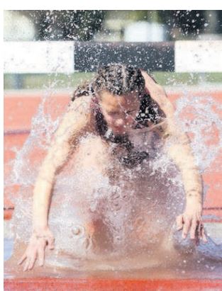
A steeplechase competitor stumbles in the water pit Friday during the Kiwanis Invitational at Kennison Field in Hermiston.