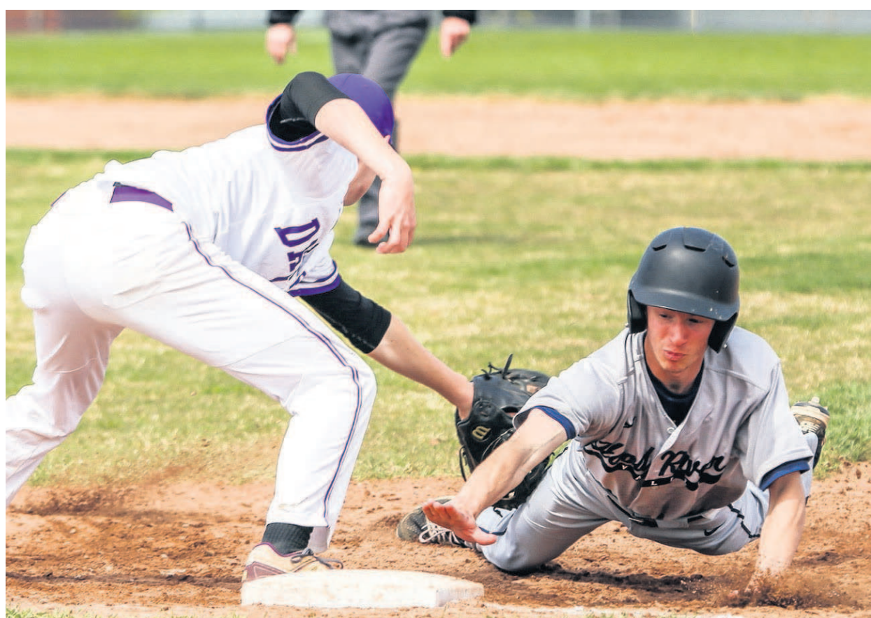
HERMISTON HERALD VALE — The Echo Cougars took a brief break from league play, sweeping Vale on the road Saturday. Echo held the host school to only three runs in both games, winning the first 16-3 and the second, 17-3.

After dropping the first game to some miscues, Hermiston rallied to open CRC 1-1