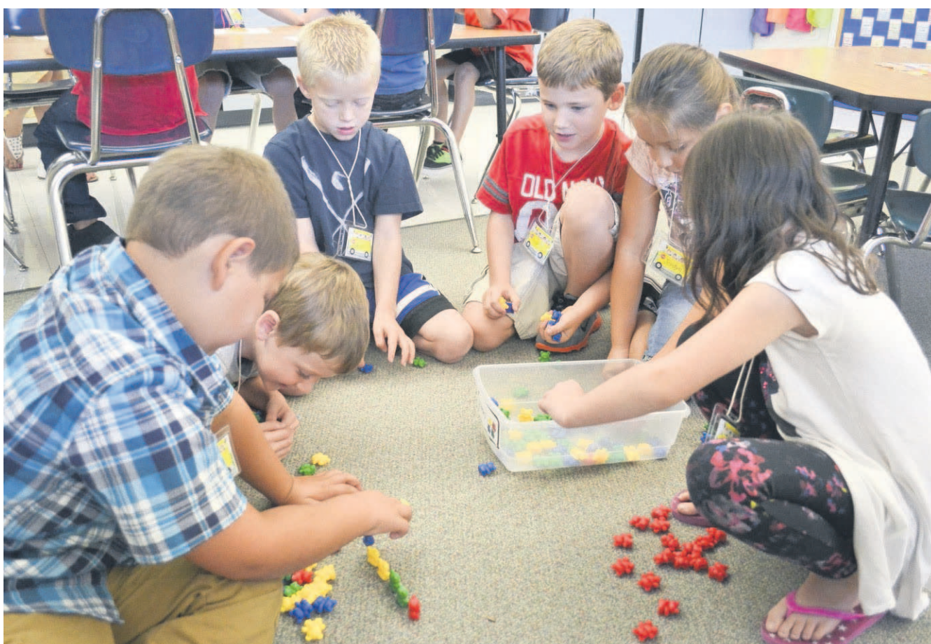
Desert View Elementary School kindergarteners participate in an activity during their first week of school in this 2014 photo.

She said because the teachers administer the tests