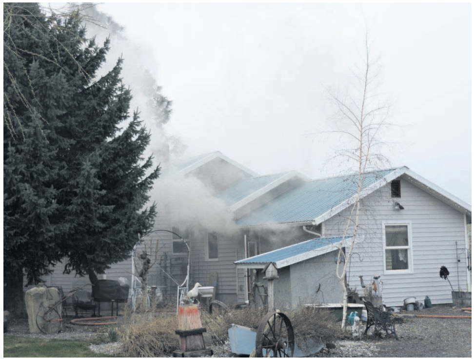
Umatilla County Fire District #1 responded to a house fire on North Ash Road in Stanfield Tuesday afternoon. The fire may have started in the basement, and smoke was coming out of the chimney and eaves, but officials at the scene said the cause was still unknown. No one was injured.