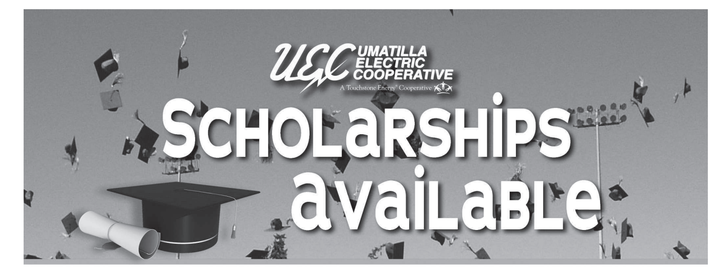
Umatilla Electric is offering the following scholarships for the 2018-19 school year:

He spoke at local schools about his two Army tours in Vietnam