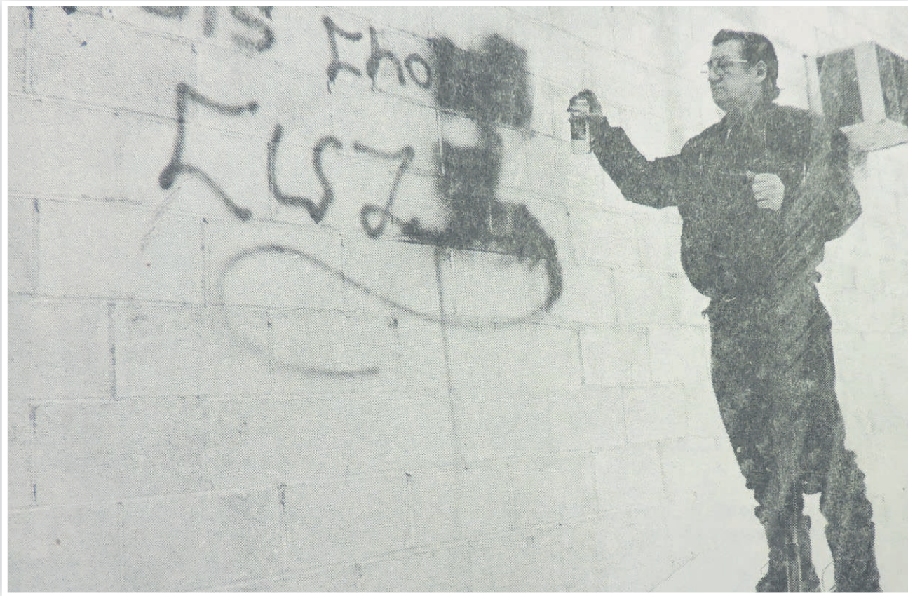
HH FILE PHOTO.