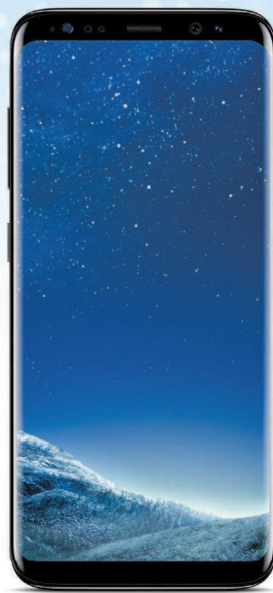
SAMSUNG Galaxy S8