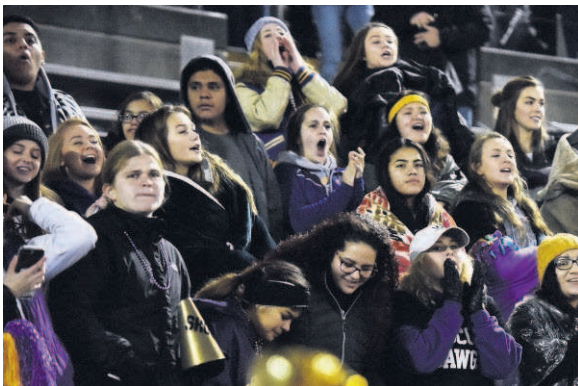
Bundled up Hermiston fans cheer for the team as they are introduced on the field before the start game.