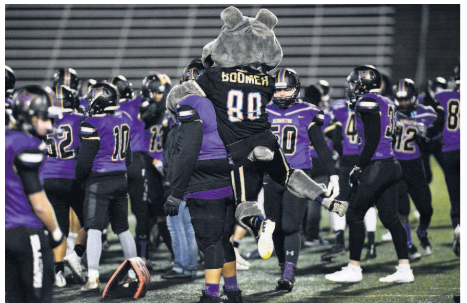
The Hermiston Bulldog Boomer leaps on the back of an unlisted player on the roster in the 5A state championship game on Saturday in Hillsboro.