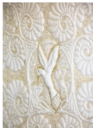
The dove on a quilt, made by Shelly Coykendall, is an example of a raised trapunto design.

adorns one wall in the hallway, while a patterned bedcover in fall colors sits in the guest room. The collection is just this season's quilts — Coykendall has a closet full of others ready for Christmastime, spring