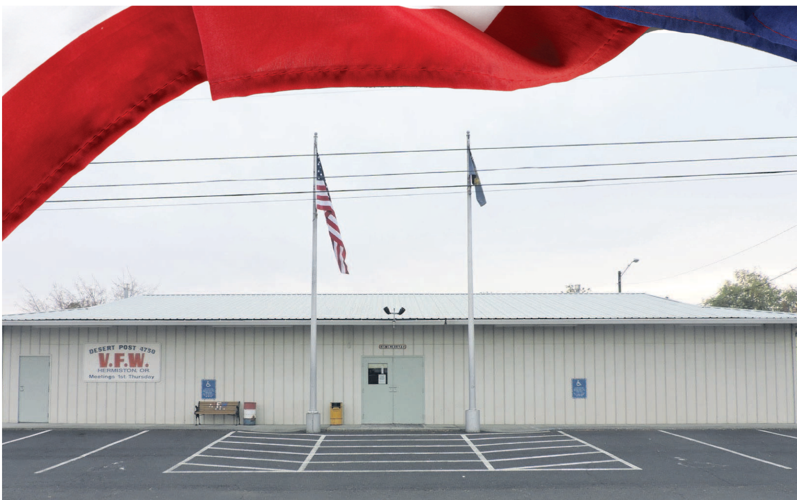
The VFW Post 4750 at 45 West Cherry Ave, Hermiston.