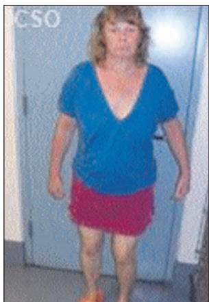
UCSO AND HERMISTON POLICE DEPARTMENT