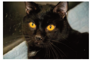
Eclipse is a 3 year old male Domestic Short Hair Mix

Available for adoption at PAWS 517 SE 3rd St.