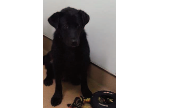
Koby is a 1 year old male Lab/ Retriever Mix

Available for adoption at PAWS 517 SE 3rd St.