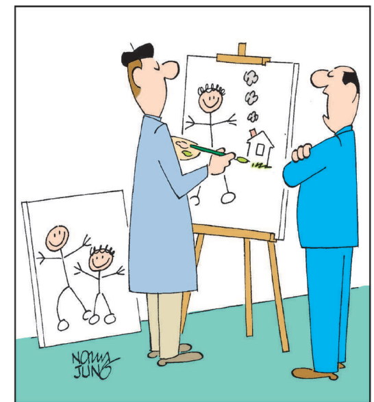
"Have you ever thought this might not be your line of work?"