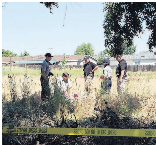
Police from multiple agencies investigate a vacant lot in the vicinity of Southwest 13th Place and West Highland Avenue, Hermiston. The major crime team was activated after a man was shot to death in the area early Saturday morning.

land, which they combed for evidence on Saturday morning.