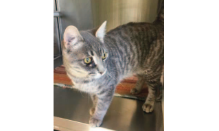
Justin is a 9 month old male Domestic Shorthair Mix

Available for adoption at PAWS 517 SE 3rd St. Sponsored by Pupcakes