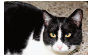
Little Mommy is a 5 year old female Domestic Shorthair Mix

Available for adoption at PAWS 517 SE 3rd St. Sponsored by Pupcakes