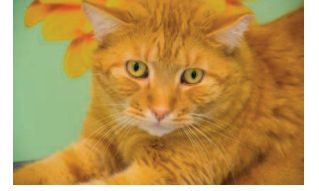
Boy Boy is a 4 year old male Domestic Shorthair Mix

Available for adoption at PAWS 517 SE 3rd St. Sponsored by Pupcakes