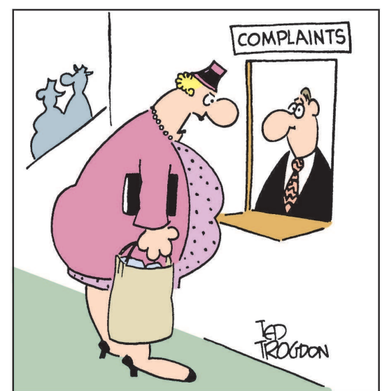
"For openers, I don't like your necktie."