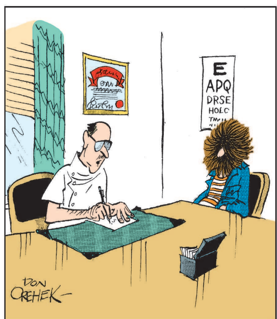
"Take this prescription to any barbershop."