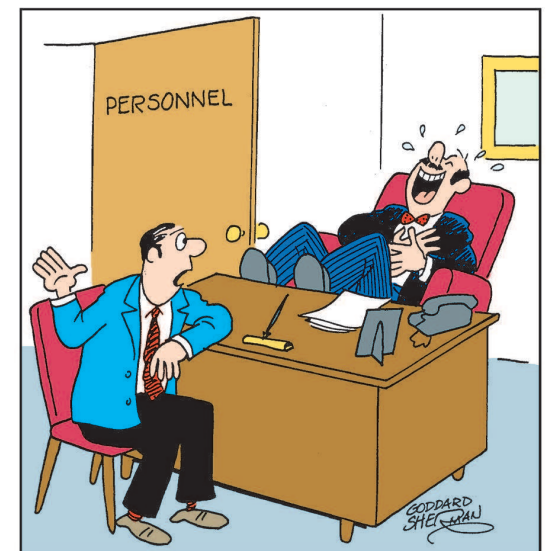
"No, really, I was an efficiency expert for the government."