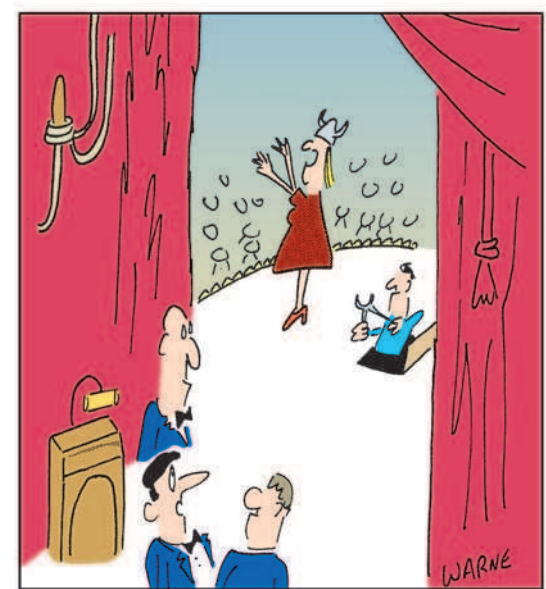
"Let's just say I've taken measures to ensure that she won't miss the high note again."