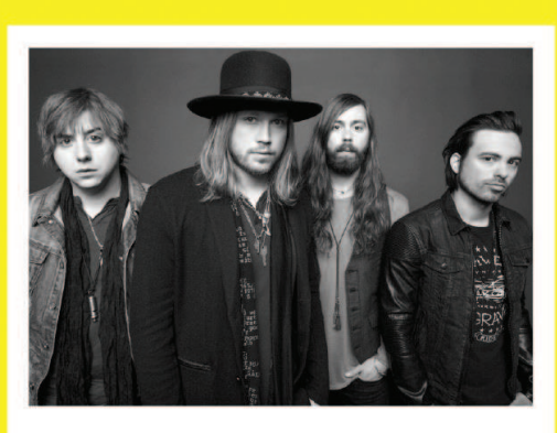
Tues. Aug. 9 · 9pm A Thousand Horses