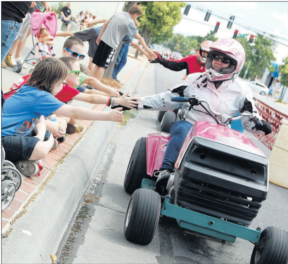
Kids reach out to high-five drivers during the Outlaw Lawn-Dragsters races Saturday during Funfest.