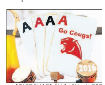
One of the ACES Car Show trophies on display before the awards were presented Saturday, May 28.

More than 100 vehicles were on display at the ACES Car Show on Saturday in Echo, which is a fundraiser for the high school car club that puts it on.